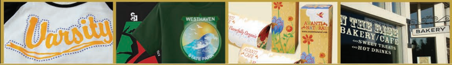
APPAREL HEAT TRANSFER, APPAREL & GARMENT RHINESTONE, PACKAGING DESIGN MOCKUP, CONTOUR-CUT STICKERS & DECALS, VINYL SIGNS/LETTERING